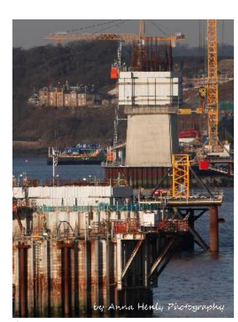
Central Tower grows out of the Beamer Rock.