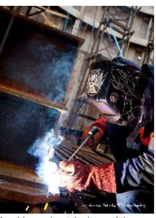
A welder works at the base of the South Tower before a concrete pour.