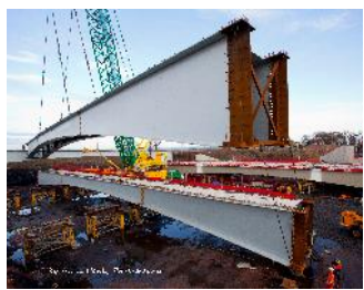
Girders are craned into position

All three of the Queensferry Crossing's towers are simultaneously under construction - the bridge is truly out of the water and heading upwards. Above: the construction activity on the water can be seen through the almost completed Southern Approach Viaduct Pier. http://www.transportscotland.gov.uk/