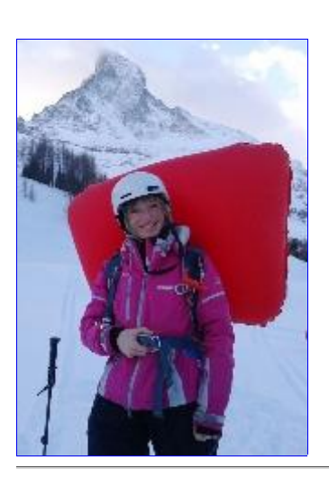
My last newsletter was written a year ago - time is flying. I spent three weeks over Christmas guiding skiers in the ski resort of Verbier, Switzerland, for the Ski Club of GB. Dodgy avalanche conditions prompted the purchase of an avalanche airbag (shown inflated for testing purposes).