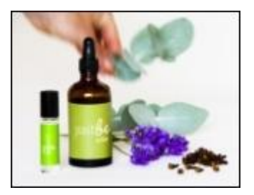
Studio product photoshoot

http://www.photoshot.com If you have any specific requirements please contact me directly.