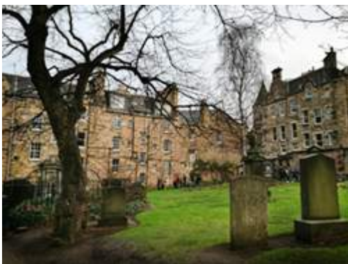
Graveyard, which inspired the Voldemort/Potter duel!

can connect with other students and share your photos!