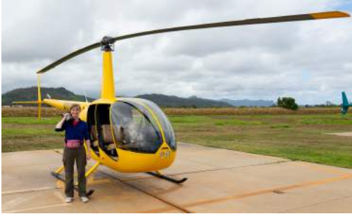
Happiness is .....a tiny helicopter with NO DOORS , above "Jurassic Park" on Kauai, Hawaii