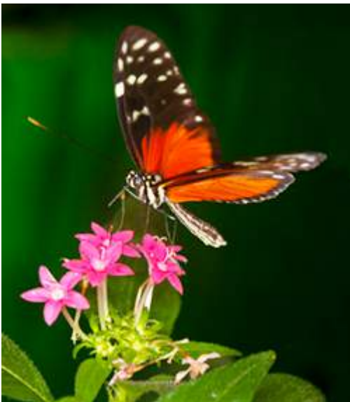
An exotic "tarricina long wing" butterfly

I teach macro photography workshops at Edinburgh's Butterfly & Insect World - for those who like chasing butterflies, snakes, geckos and spiders. We can advise on gear and can lend you a Nikon macro or close-up lens - you will soon be hooked on the miniature world.