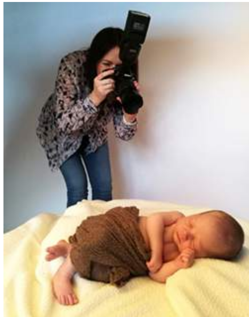
Learn top tips for a newborn baby