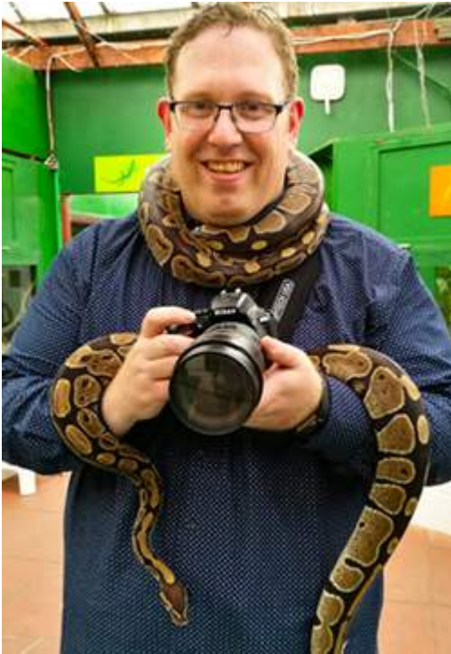
African royalty and a Going Digital student love wearing the royal python!

And when it gets too hot and steamy in the jungle we can return to the Anna Henly Photography studio to photograph garden flowers or tiny objects with studio lighting!