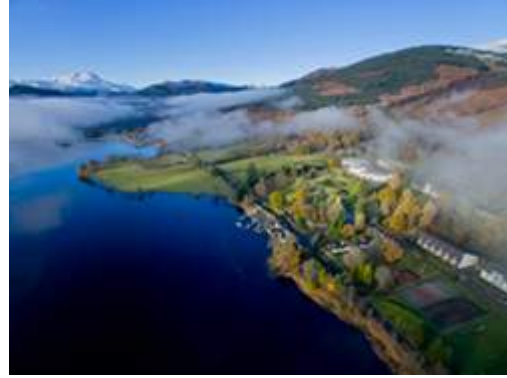
MacDonald Forest Hills Hotel and Spa