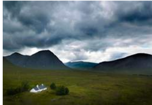
Blackrock Cottage, Glencoe

Our low light workshops in Edinburgh, Glasgow and Inverness have proved very popular. The next one will be in DUNDEE. All you need is a tripod, gloves and chocolate!