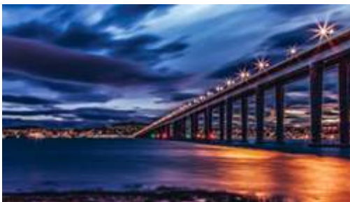
The River Tay