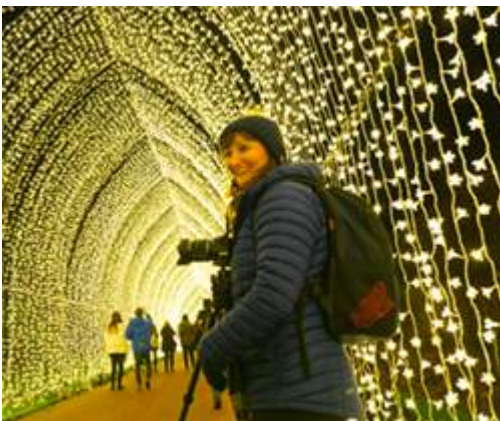
"Christmas at the Botanic" in Edinburgh

I am creating a Going Digital calendar for 2020 with STUDENT images. Please send me some of your best pics, which I am uploading to a gallery on the Going Digital Scotland Facebook site for you all to "like" your favourites! The favourite so far is.....a robin with an attitude.