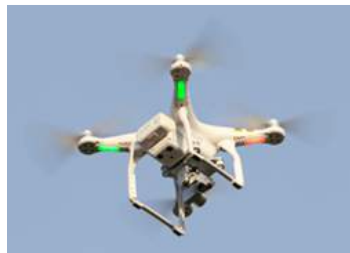
A DJI Phantom 3 Pro