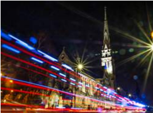
An ambulance streaks past in Glasgow