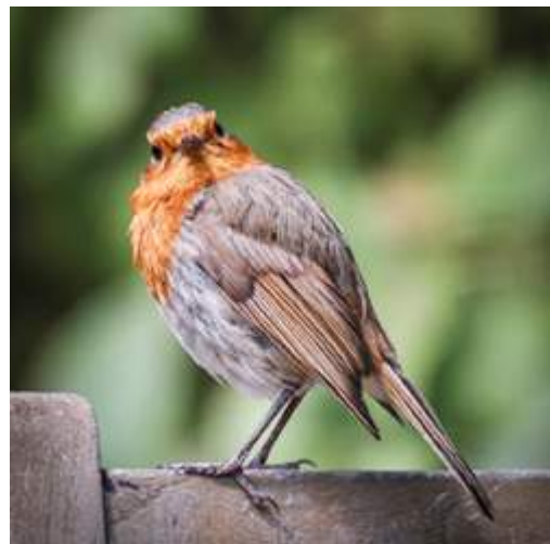
"Are you looking at me?" by Lois Newell