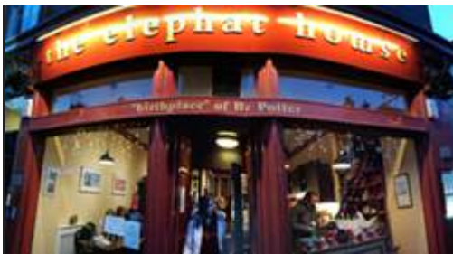
Coffee break, where J.K. Rowling wrote her books