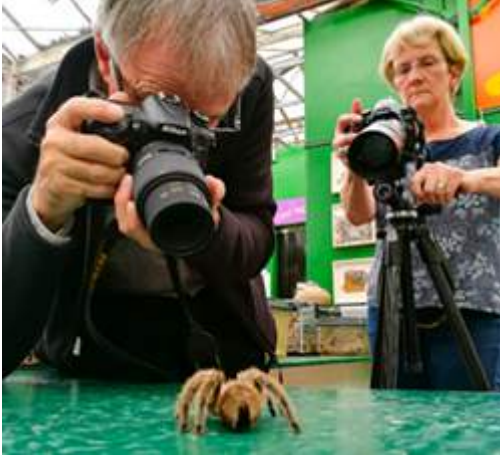
"Rosie", the Chilean rose tarantula. Pick her up if you dare!