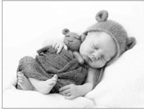
Black and white is very flattering and timeless