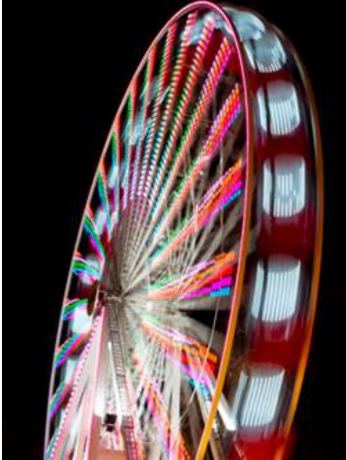
The ferris wheel at Edinburgh's Xmas market