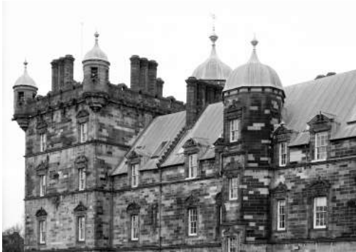
Hogwarts (George Heriot's School)

to the streets during the madness and exuberance that is the Edinburgh Fringe Festival! Harry Potter fans will appreciate a walk featuring the locations which inspired J.K.Rowling. Photowalks will be suitable for all cameras, as well as SMART PHONES. The best camera for the job.....is the one in your hand!