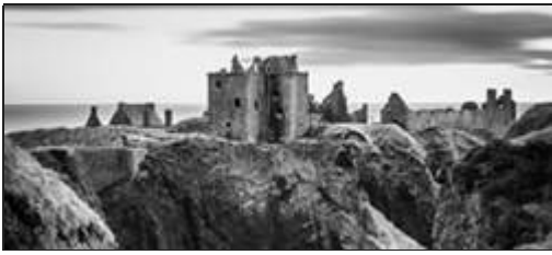
Dunnottar Castle - Mel Gibson played Hamlet!

"Introduction to Landscape", "1:1" and "Lightroom processing" in Aberdeen.