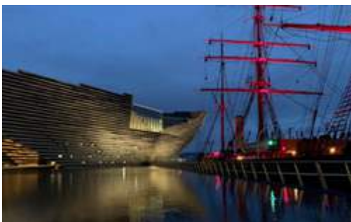
The V&A and RRS Discovery