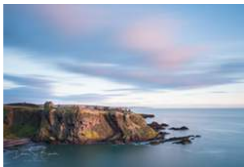
The view from the cliffs near Stonehaven