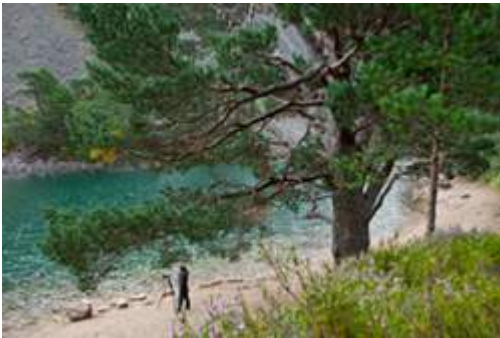
Photographing at the Green Lochan

We will be returning to Aviemore in May for a day of landscape photography, followed by wildlife photography at the Highland Wildlife Park.