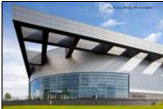
Sir Chris Hoy Velodrome, Glasgow