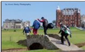
Swilcan Bridge, The Old Course, St Andrews