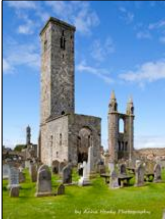
St Andrews Cathedral