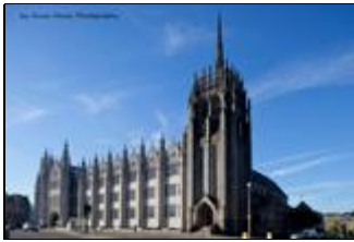
Marischal College, Aberdeen